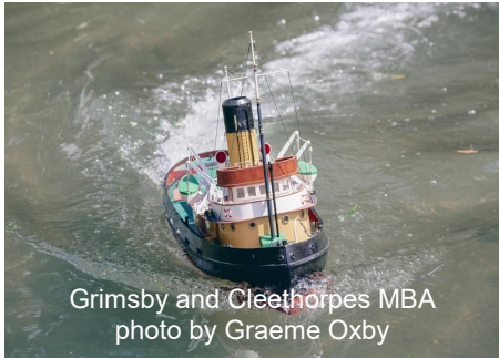
Grimsby and Cleethorpes MBA